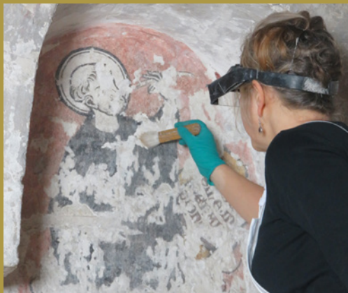
Conservation on the wall paintings in the South Transept