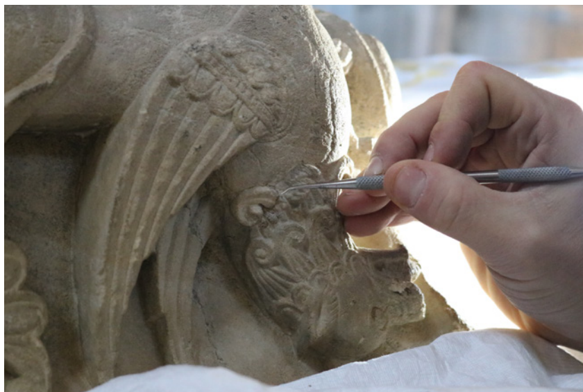
Specialist stone conservation

If you choose to leave a legacy to our Fabric Fund, you'll be doing something invaluable – enabling us to plan our conservation and maintenance work on a sound basis for the future.