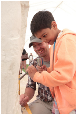
Stone Festival – a stonemason of the future?

The Cathedral is a living place of work, worship, learning and enjoyment. Eighty staff and eight hundred volunteers play their part in looking after visitors, maintaining the buildings and grounds, developing activities and events and ensuring its financial resilience.