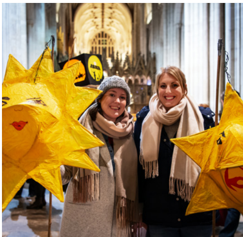
Our popular annual Lantern Parade