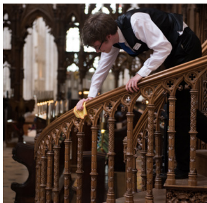
Our team of Virgers are key to the smooth running of the Cathedral