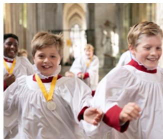
All boy Choristers are given a choral scholarship at Pilgrims' School

Our Cathedral Choir is recognised as one of the finest in the world but keeping music of this quality open for all to enjoy is expensive. If you'd like to leave a legacy to this fund, it will help train future choristers, and support the Music Department in its daily work to keep this wonderful music alive for future generations to enjoy.