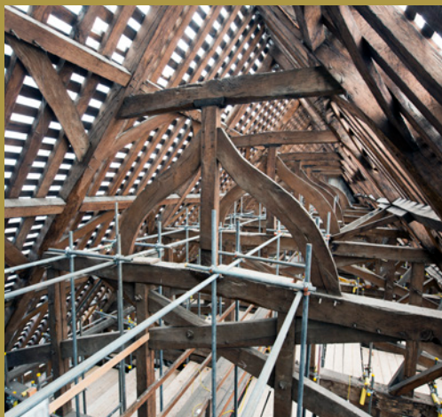
Re-leading works taking place on the early 16th century roof of the Presbytery (daylight can be seen through the roofing boards)