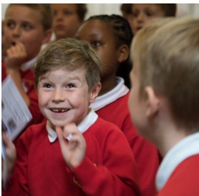
We welcome school groups almost every day during term time