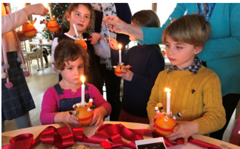
Preparations for the Christingle service