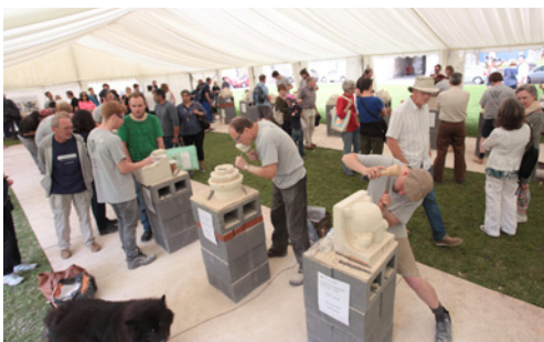
The Stone Festival showcases the craftsmanship of Stonemasons across the country