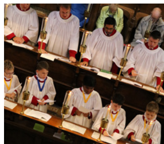
The Cathedral's 12 lay clerks are all members of Cathedral staff