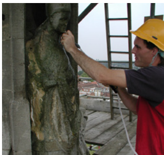
Repairing the statue of Bishop Fox