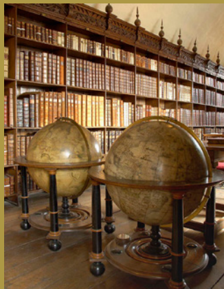
Morley Library and the 17th-century Blaeu Globes