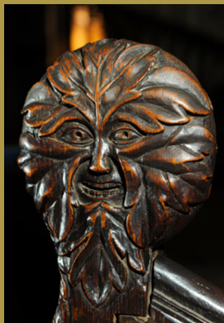
This Green Man corbel is one of the many intricate wooden carvings found in the Quire stalls