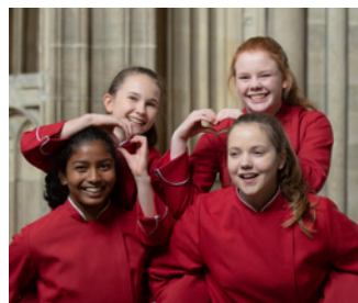
Our Girls' Choir sings weekly services in the Cathedral during term-time